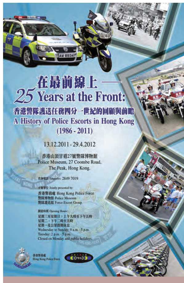
警隊護送組與警隊博物館合辦專題展覽，慶祝該組成立二十五周年。 Force Escort Group (FEG) and the Police Museum jointly present a thematic exhibition to mark the 25th anniversary of the establishment of the FEG.