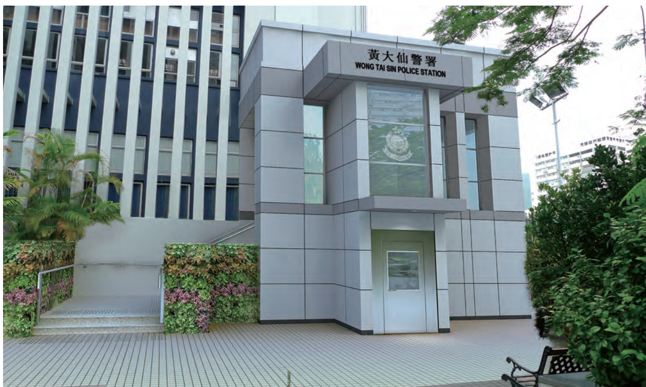
黃大仙警署的翻新工程於二零一二年四月開始。 The refurbishment work of Wong Tai Sin Police Station starts in April 2012.

During the year, the Planning and Development Branch implemented various capital works to facilitate the Force in providing a high standard of professional services to the community. Funding had been secured for the reprovisioning of the Lamma Police Post and Kowloon Vehicle Pound and Examination Centre. Construction of the Police boundary crossing facilities at Kai Tak Cruise Terminal and Guangzhou-Shenzhen-Hong Kong Express Rail Link West Kowloon Terminus were underway. The year under review also saw the launch of the retrofitting program of barrier-free facilities in 64 police premises.