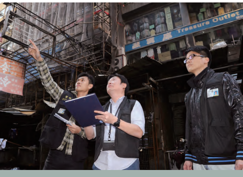
警務人員調查在旺角花園街發生的懷疑縱火案。 Police officers investigate a suspected arson case at Fa Yuen Street, Mong Kok.

Specific projects such as Shopkeepers Charter and Operation QUICKFLYER were initiated to enlist the support of shopkeepers, mutual aid committees, owners' corporations and other building management bodies to fight against crime. In order to promote social integration with the local community and foster a healthy environment for youngsters in Kowloon West area, various sports and development programmes including Kowloon West Youth-Care Challenge Camp 2011, Kowloon West Local and NEC Youths Culture and Heritage Tour and Kowloon West NEC Talent Show were run under the auspices of the Kowloon West Youth Care Committee.