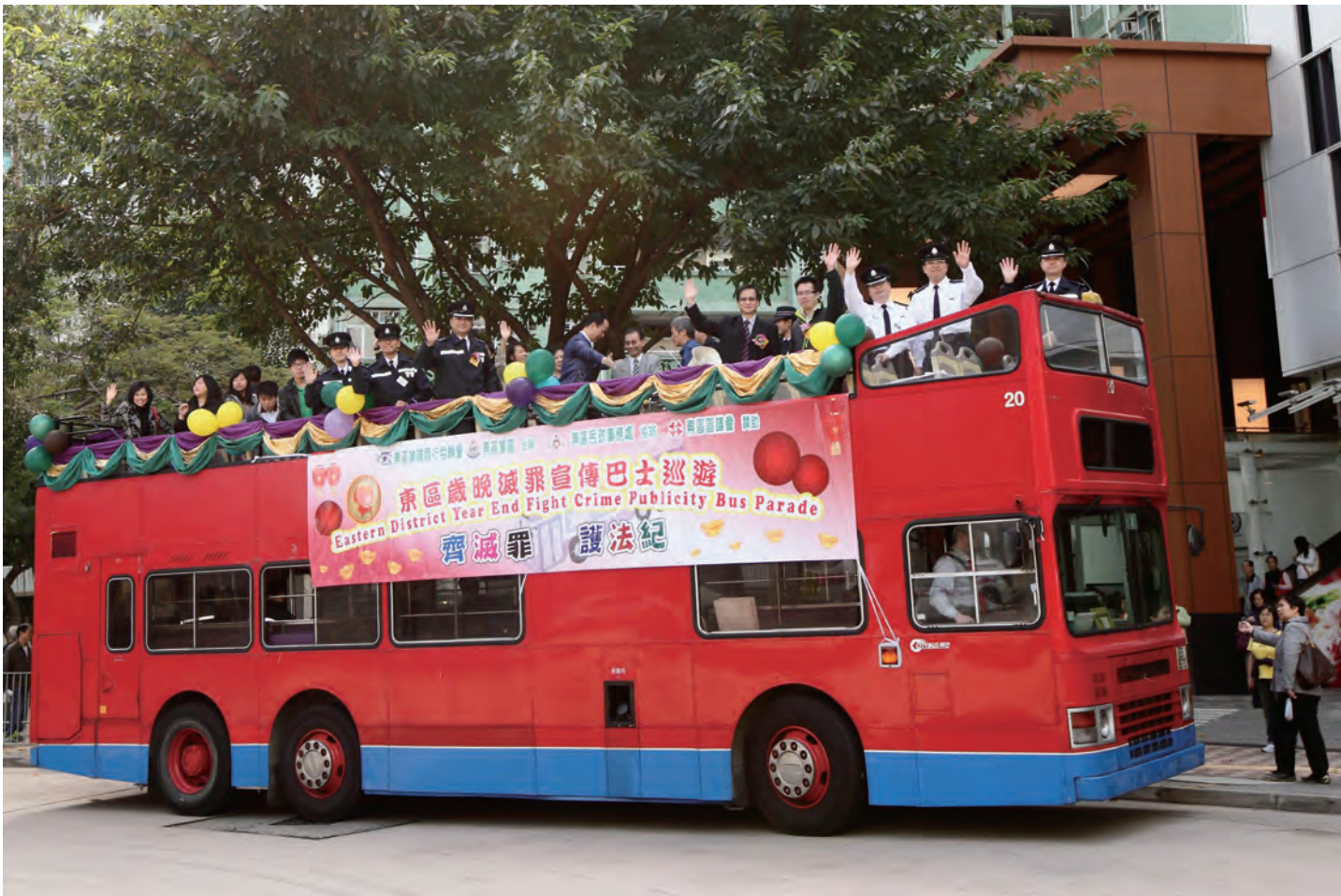
東區警區及東區撲滅罪行委員會合辦東區歲晚減罪宣傳巴士巡遊。 Eastern District and Eastern District Fight Crime Committee co-organise a Lunar New Year Fight Crime Publicity Bus Parade.

In 2011, the Regions remained committed to serving the people of Hong Kong with pride and care, placing strong emphasis on professionalism in a changing world and working in partnership with the community. The prevention and reduction of crime was supported by a series of projects together with various sectors of the community, Government and non-governmental agencies. Operationally, the Regions continued to mount intelligence-led operations and to adopt a multi-agency approach to combat triad and vice-related crime, cross-boundary drug trafficking, youth crime, compensated dating and other illegal activities. Looking ahead, a number of major infrastructure developments will require further Police commitments and expertise. The Force is doing all it can to mitigate the effect of such new developments on the community.