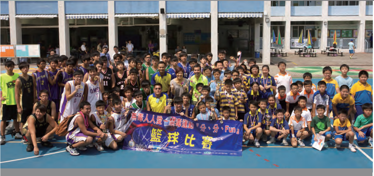
觀塘警區與觀塘區、西貢區撲滅罪行委員會和路德會合辦無毒籃球比賽。 Kwun Tong District, Kwun Tong District and Sai Kung District Fight Crime Committees and Lutheran Centre organise an anti-drug basketball match.