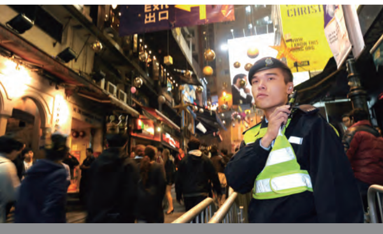
警方實施人群管理措施，以便市民進行節日慶祝活動。 Police implement crowd management measures to facilitate the territory's festive celebration events.

二零一一年，總區仍以處理公眾活動為重要任務，投放了大量時間和資源處理超過4 000個公眾活動，當中包括為二零一一年至二零一二年度香港特區政府財政預算案和二零一一年區議會選舉的示威活動、七一遊行、每年一度的國際馬拉松賽事，以及蘭桂坊和灣仔一帶酒吧區的節日活動作出特別安排。