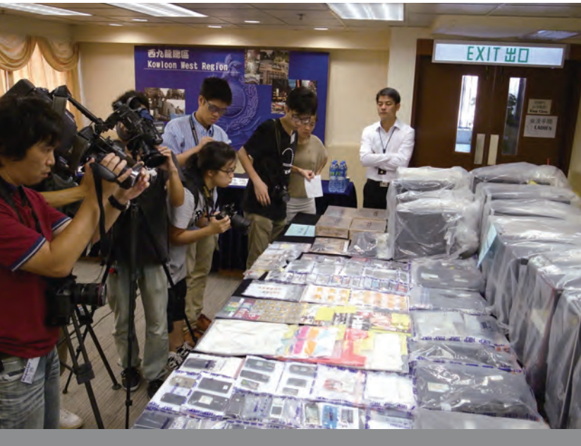
西九龍總區刑事部人員展示在反援交行動中檢獲的證物。 Exhibits seized by Crime Kowloon West officers in an operation targeting compensated dating.

為了讓非華裔人士更融入社區及進一步推動他們參與防止罪行工作，總區委任分區前線人員擔任非華裔社群聯絡員，並在警區層面成立特遣隊，加強非華裔社群與警務人員之間的互相了解，從而打擊涉及非華裔人士的罪案。