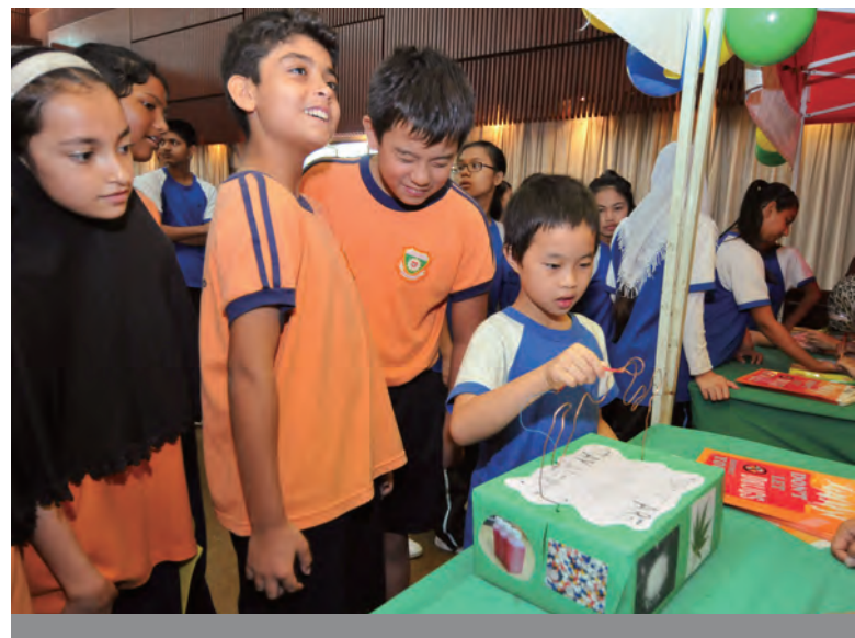
油尖警區舉行禁毒宣傳活動以提醒學生濫毒的禍害。 Yau Tsim District launches an anti-drug publicity campaign to remind students of the grave consequences of drug abuse.