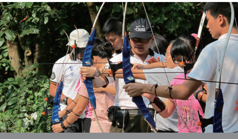
「星火行動」是打擊青少年吸毒的警察義工活動。 Project Sparkle is an activity run by Police volunteers to combat drug abuse among youngsters.

The presence of a large cycling track network is a special feature of the Region, particularly in Sha Tin and Lantau Districts. With cycling becoming a popular sport, the Region organised various publicity and education programmes together with District Councils and the Road Safety Patrol to raise public awareness of safe cycling.