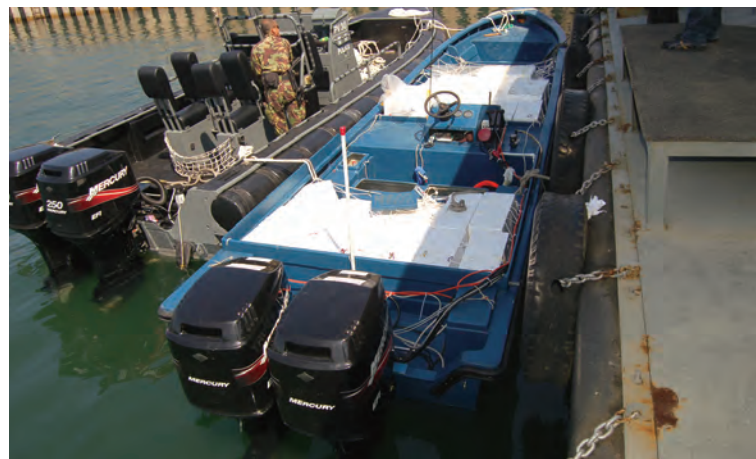
水警扣押涉嫌海上走私的大馬力快艇。 Marine Police seizes a high-powered speedboat involving in suspected smuggling activities.

During the year, the Region participated in a number of major search and rescue operations both inside and outside territorial waters, saving 29 lives at sea.