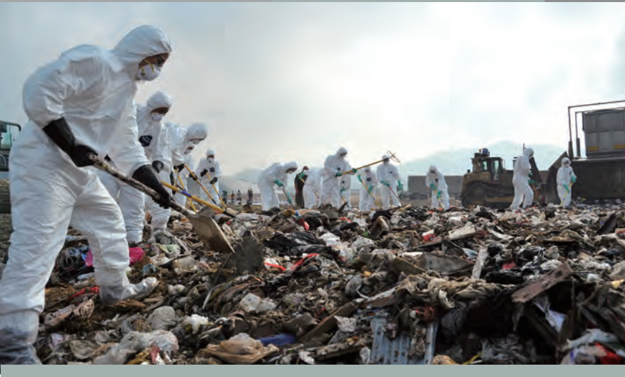
新界北快速應變部隊及警察機動部隊人員於屯門的新界西堆填區搜尋謀殺案證物。 Police officers of New Territories North Quick Reaction Force and Police Tactical Unit search for evidential items of a murder case in West New Territories Landfill in Tuen Mun.