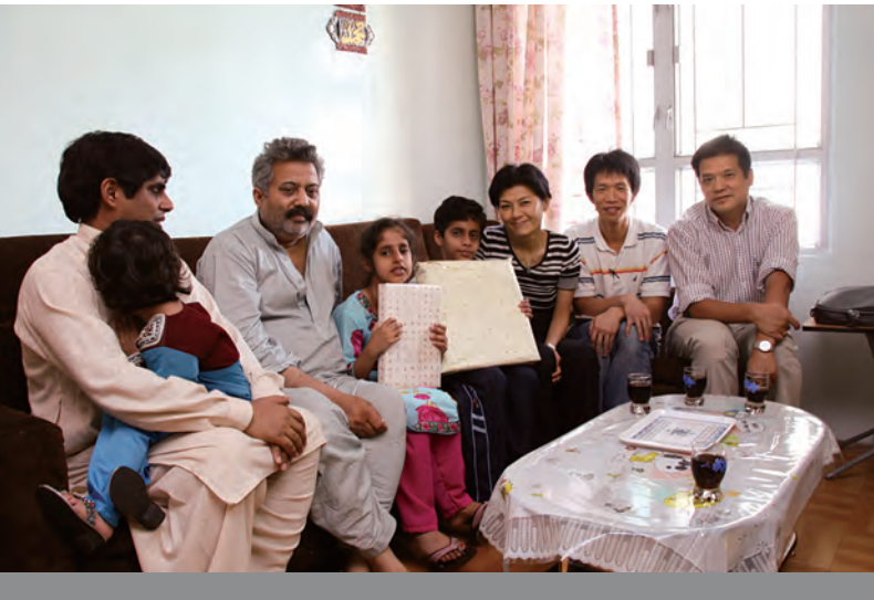
警務人員定期探訪非華裔家庭，協助他們融入社區。 Police officers visit non-ethnic Chinese families on a regular basis to assist their integration into the community.