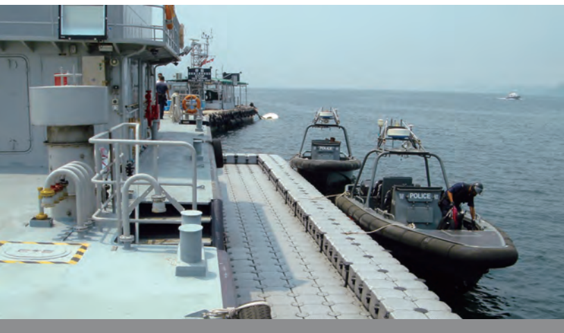
從吉澳調配到吐露港赤門海峽的四號警察躉船，旁邊停泊了分區快速巡邏警輪。 Police Barge 4 is relocated from Kat O to Tolo Channel, with Divisional Fast Patrol Craft moored alongside it.

二零一一年，總區參與多項在本港水域內外進行的大型搜救行動，並拯救29名在海上遇險人士。