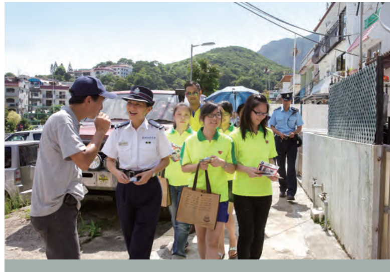
將軍澳分區與西貢區撲滅罪行委員會向村民宣傳防盜信息。 Tseung Kwan O Division and Sai Kung District Fight Crime Committee disseminate anti-theft messages to villagers.

觀塘警區與觀塘及西貢區撲滅罪行委員會合辦「長者滅罪大使」計劃，招募區內長者擔任滅罪大使。140名滅罪大使到區內老人中心及商場演出舞台劇，透過前輩的相互影響，將防騙的信息宣揚開去。