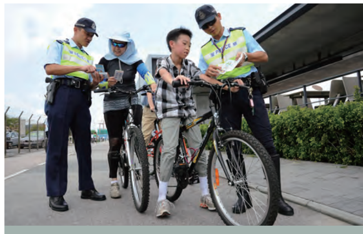
新界南總區交通部人員向騎單車者派發單車安全小冊子。 Police officers of Traffic New Territories South distribute safe cycling leaflets to cyclists.