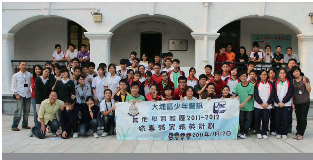
大埔警區抗毒滅罪精英計劃是為區內中學生舉辦的抗毒活動。 Drug Fighting Elite Scheme is an anti-drug activity organised by Tai Po District for secondary school students in the district.

總區繼續加強聯繫內地警務人員，打擊非法入境、走私活動及跨境罪案。八月深圳舉行第二十六屆世界大學生夏季運動會，總區與內地警務人員緊密合作，維持邊境治安和確保世界各地的貴賓、運動員及觀眾的安全。