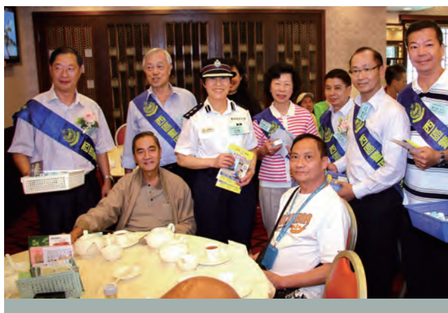
西區警區聯同南區撲滅罪行委員會舉辦滅罪宣傳活動。 Western Division and Southern District Fight Crime Committee hold a fight crime publicity event.

In 2011, public order event management remained a high priority for the Region and accounted for a significant amount of time and resources devoted to the management of more than 4 000 public order events. Of particular note were the special arrangements for the protest activities related to the 2011-2012 Budget and the 2011 District Council Elections, the July 1st Procession, the annual Marathon race, and the festive events in the Lan Kwai Fong and Wan Chai bar areas.