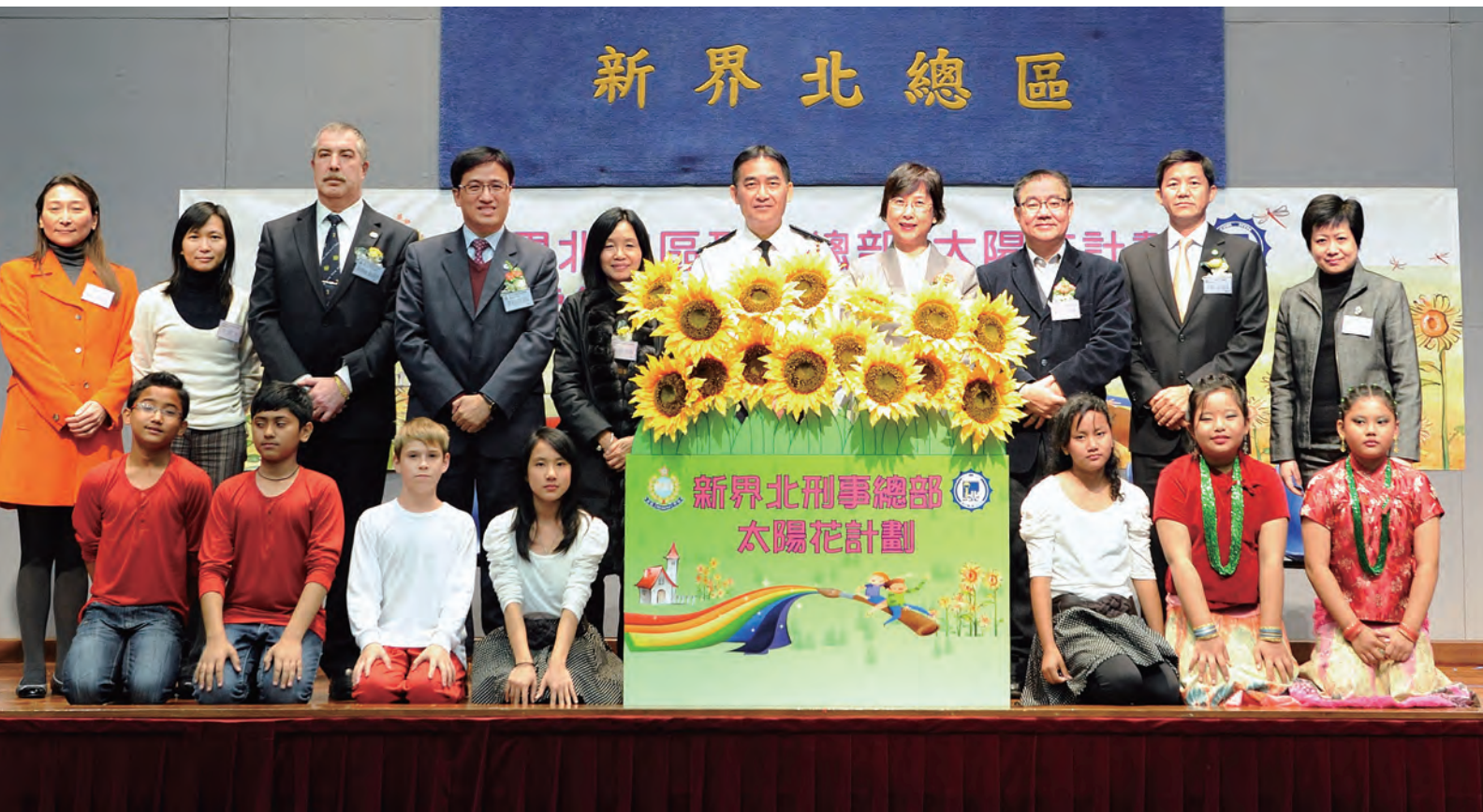
新界北總區推行的太陽花計劃，旨在推廣家庭和諧信息。 New Territories North Region launches a publicity campaign to convey the message of family harmony.

Education and prevention programmes proved to be effective measures in the Region's policing strategy. Publicity campaigns, school talks and activity camps were organised to raise public awareness of crimes. Through such activities, juveniles arrested for drug offences in the Region fell by about 10 per cent, and for those villages that installed CCTV systems following Police advice, a significant decrease of 30 per cent was seen in the number of burglary cases.