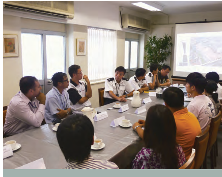
油麻地分區推動業界與警方聯手打擊地盤盜竊。 Yau Ma Tei Division works with stakeholders to combat theft in construction sites.

交通管理方面，未來五年區內將進行前所未有大型基建工程，總區在交通警政方面將面臨重大挑戰。總區目標是繼續與持份者緊密合作，研究如何透過科技及中央協調工作的效益，減輕這些大型基建項目對交通的影響。