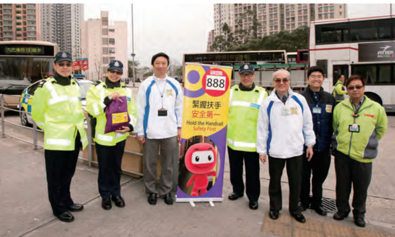
東九龍總區交通部人員向長者宣傳乘搭巴士安全信息。 Traffic Kowloon East officers bring bus riding safety messages to the elderly.

Overall crime in the Region decreased by 6.2 per cent, with notable falls in burglary, indecent assault, vehicle crime, pickpocketing, criminal damage and shop theft. The Region mounted a number of high-profile publicity campaigns and operations targeting debt collection-related crimes and telephone deceptions. Decreases were registered in both of these categories of offence.