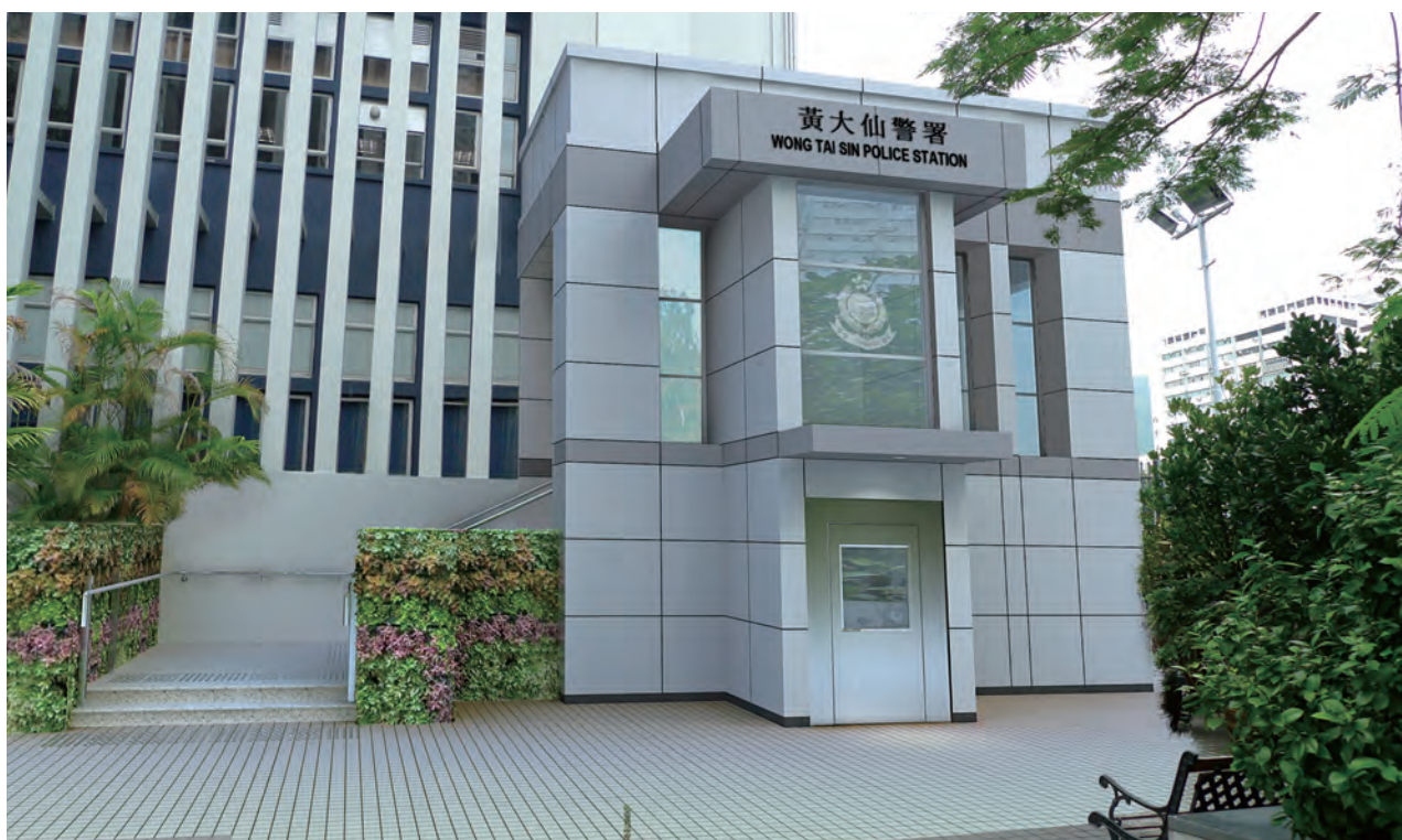
黄大仙警署的翻新工程于二零一二年四月开始。 The refurbishment work of Wong Tai Sin Police Station starts in April 2012.

During the year, the Planning and Development Branch implemented various capital works to facilitate the Force in providing a high standard of professional services to the community. Funding had been secured for the reprovisioning of the Lamma Police Post and Kowloon Vehicle Pound and Examination Centre. Construction of the Police boundary crossing facilities at Kai Tak Cruise Terminal and Guangzhou-Shenzhen-Hong Kong Express Rail Link West Kowloon Terminus were underway. The year under review also saw the launch of the retrofitting program of barrier-free facilities in 64 police premises.