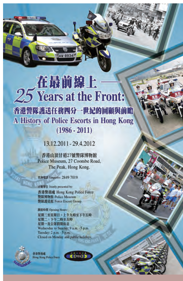
警队护送组与警队博物馆合办专题展览，庆祝该组成立二十五周年。 Force Escort Group (FEG) and the Police Museum jointly present a thematic exhibition to mark the 25th anniversary of the establishment of the FEG.