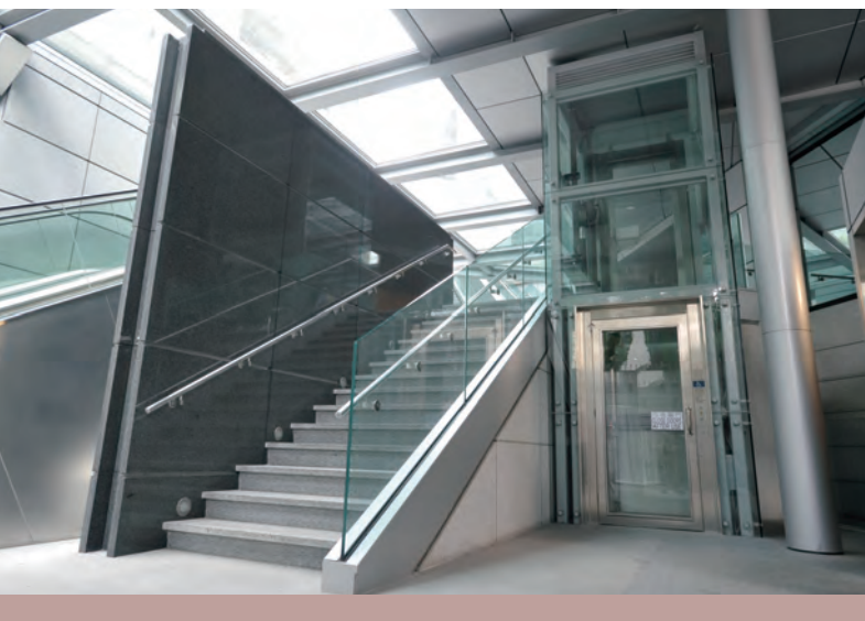
警察总部复慈花园入口的无障碍升降机平台已经启用。 The barrier-free lifting platform at Harcourt Garden entrance of Police Headquarters has been installed.

Works for Police facilities in the new control points, namely the Kai Tak Cruise Terminal and the West Kowloon Terminus of the Guangzhou-Shenzhen-Hong Kong Express Rail Link, continued in 2011. The Force also launched a programme to retrofit 64 police premises that are frequently accessed by members of public. This retrofitting will provide persons with disabilities with a barrier-free environment. Essential facilities will be completed by mid 2012.