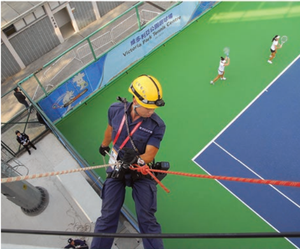
警察搜查隊人員為東亞運動會的場地進行高空搜查。 A FSU officer conducts a high-rise search at one of the East Asian Games venues.