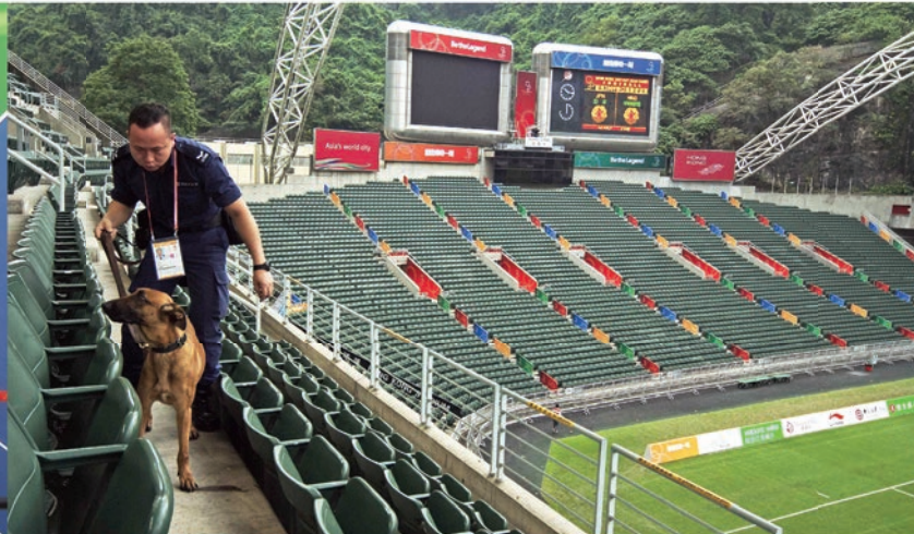
警犬隊進行搜查工作。 PDU conducts a venue search.