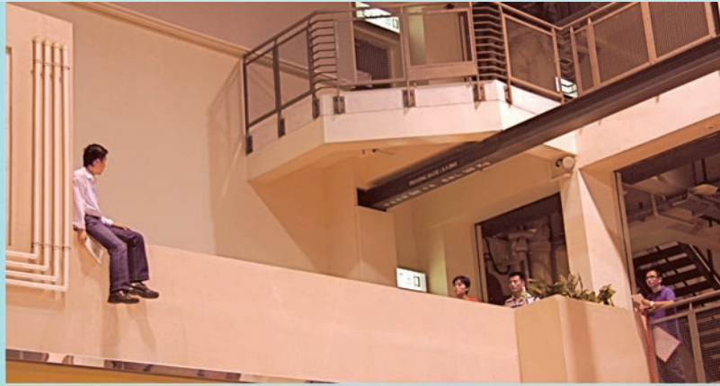
警察談判組人員進行游說訓練。 PNC officers conduct a suicide intervention exercise.