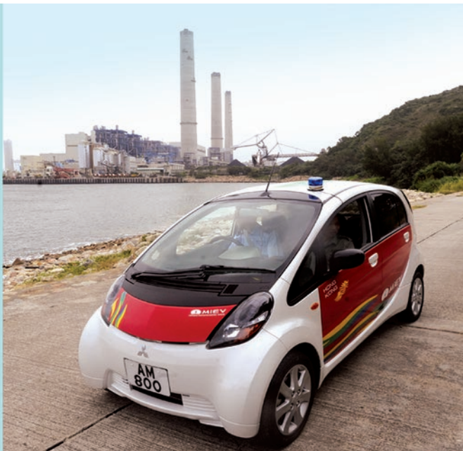
全電力驅動巡邏車。 An all-electric patrol car.

The Hong Kong Auxiliary Police Force, which celebrated the 50th Anniversary of its establishment in 2009, continues to augment the regular Force in crowd management and crime fighting. This year, the Auxiliary Force also assisted regular officers in watch and ward duties during the East Asian Games.