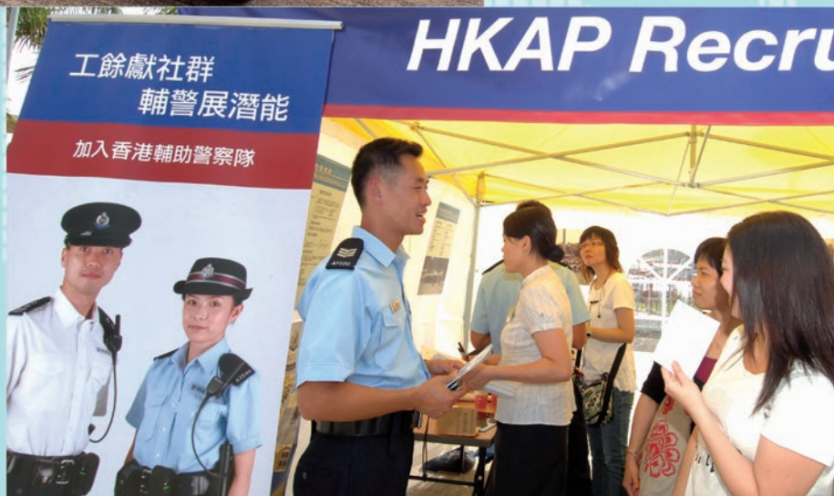
輔警人員向市民介紹 輔警隊的工作。 Auxiliary officers introduce the work of the Auxiliary Police to members of the public.