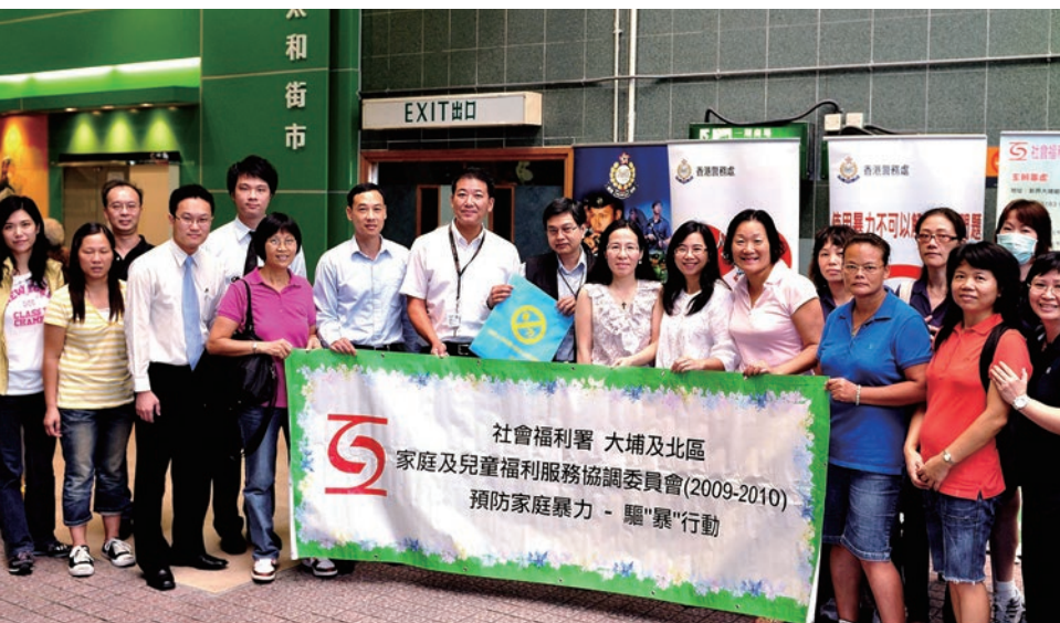
警方與社會福利署合辦「驅暴行動」，向居民宣傳預防家暴信息。 The Police and Social Welfare Department organise a publicity campaign to promote the prevention of domestic violence.