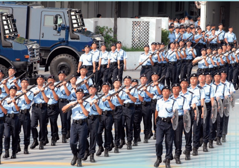
警察機動部隊總部在慈善開放日舉行多項活動包括大會操和防暴示範。 The PTU Headquarters' Charity Open Day features a variety of activities including a grand parade and an anti-riot demonstration.