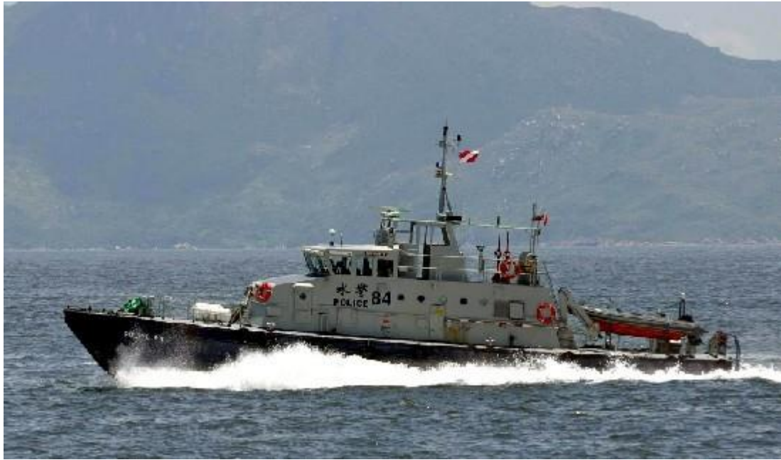
Police Launch No. 84 King Kan Damen Mark III Divisional Patrol Launch (1985 – 2010)