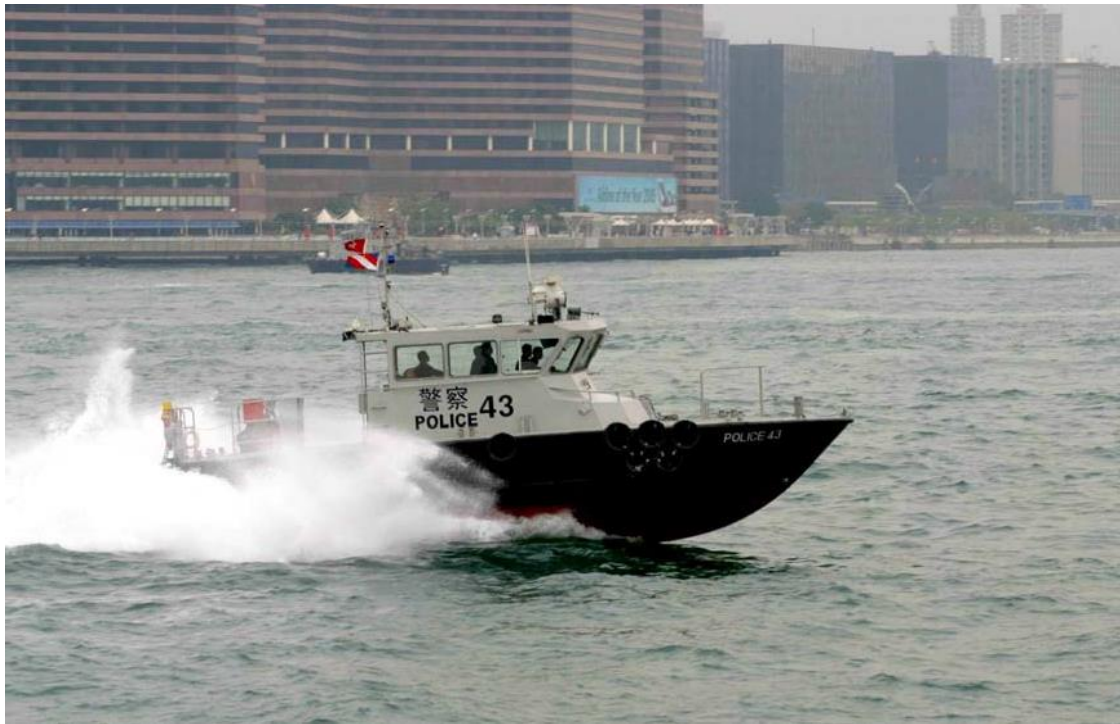
Police Launch No. 43 Cheoy Lee Inshore Patrol Craft (In service since 2000)