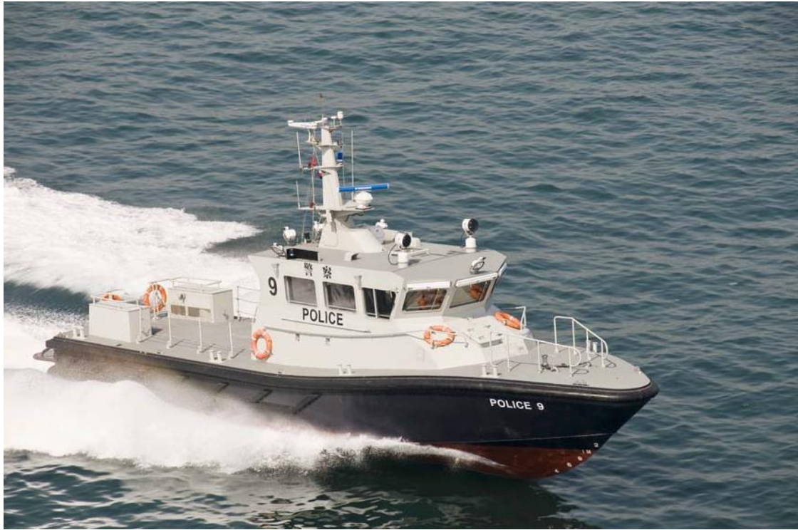
Police Launch No. 9 Medium Patrol Launch (In service since 2007)