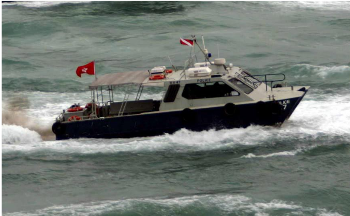
Police Launch No. 47 Seaspray Catamaran 11.4m Vessel Logistic Launch (In service since 1992)