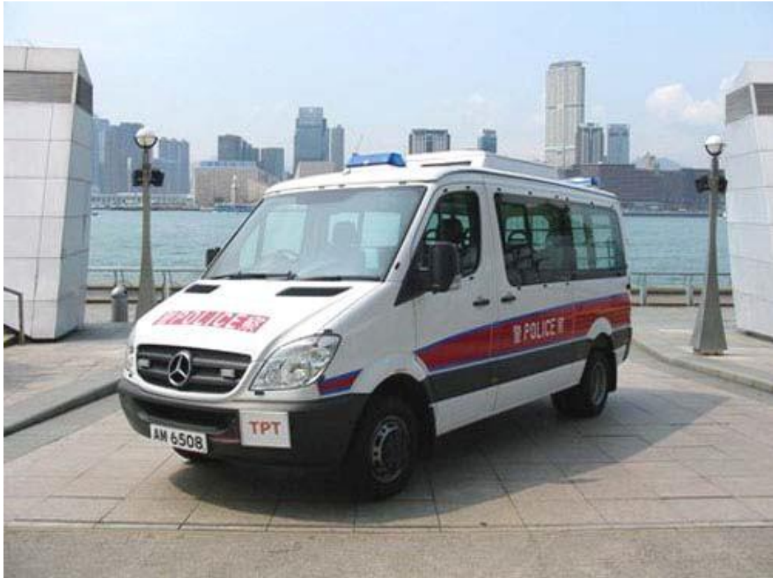
Van Large – Benz 519 CDI Used for patrol and operational duties (In service since June 2011)