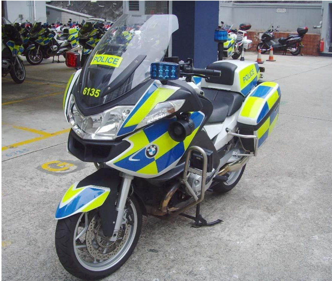
Motorcycle Large – BMW R900RT Used for patrol and traffic enforcement duties (In service since Sep 2010)