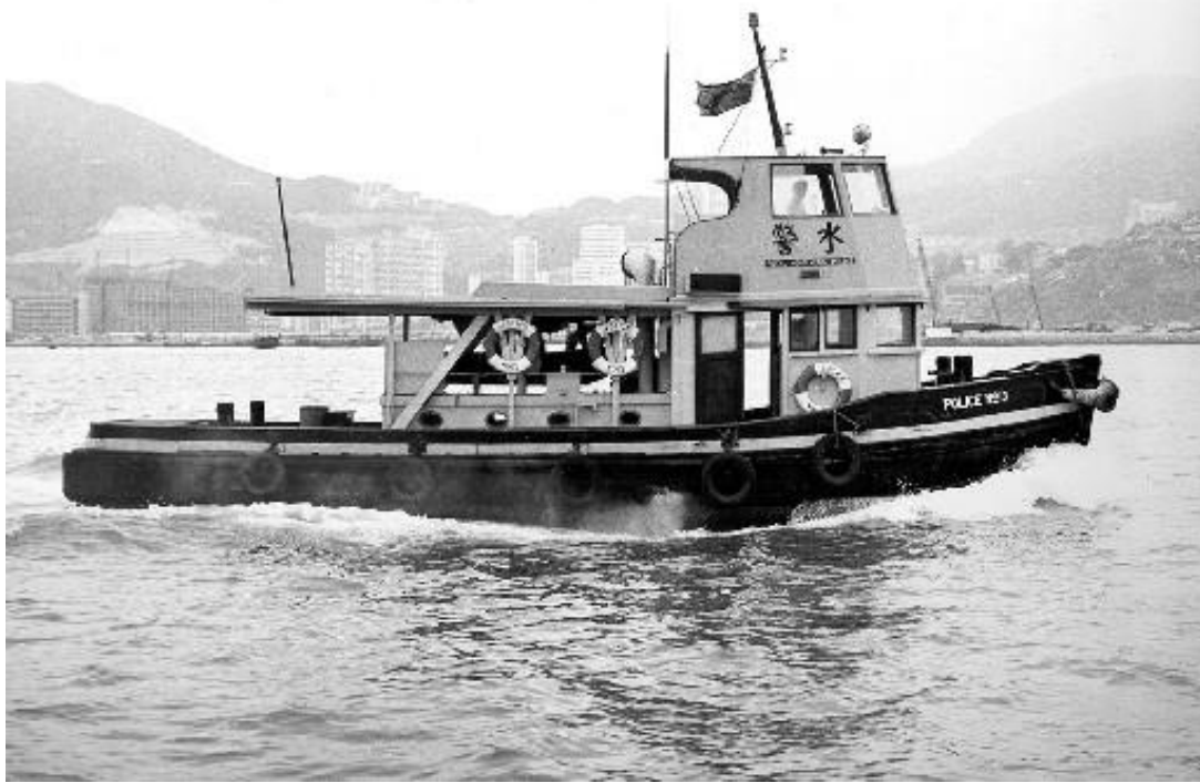
Police Launch No. 13 Harbour Patrol Launch (1946 – 1987)