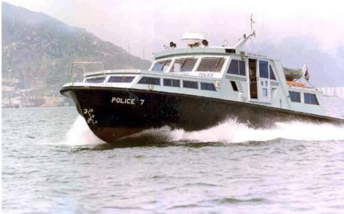
Police Launch No. 7 Dragon (The Commissioner's Barge) Logistic Launch (1975 – 1985)