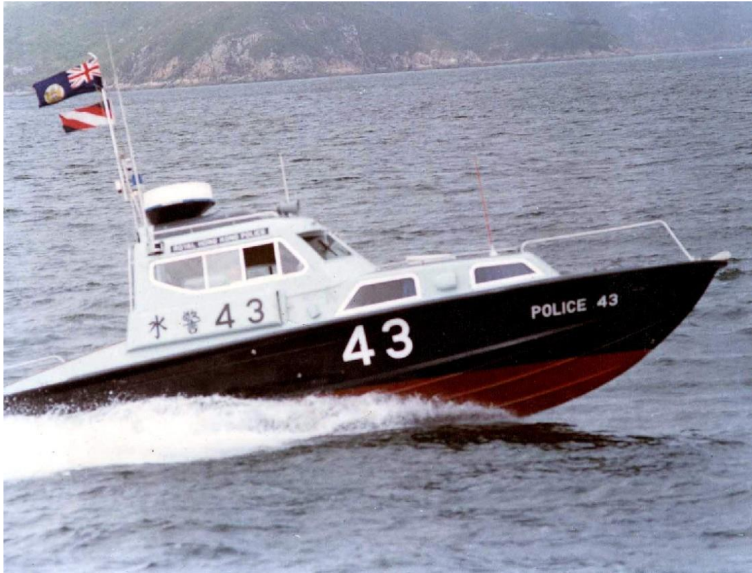
Police Launch No. 43 Fairey Spear Police Motor Boat Inshore Patrol Launch (1982 – 1992)