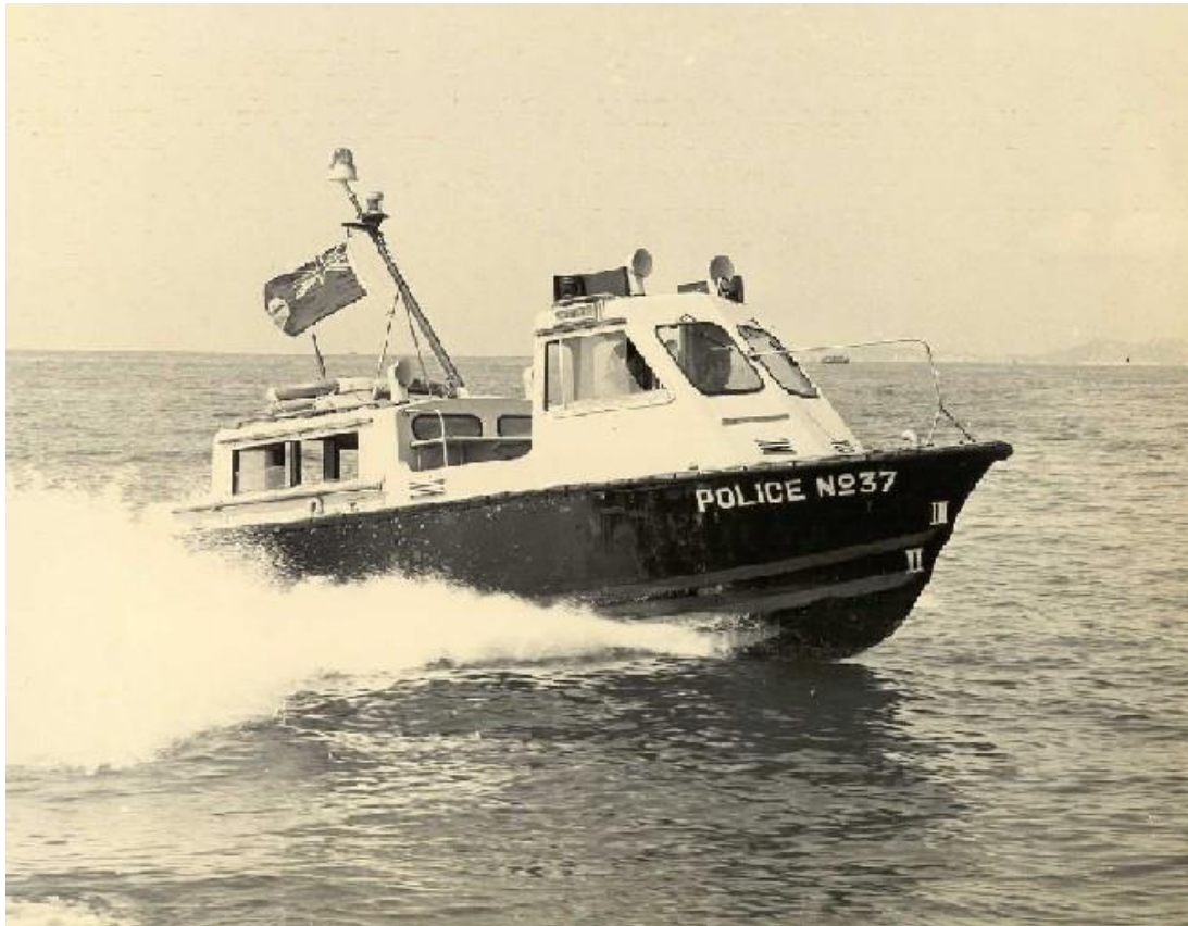
Police Launch No. 37 Javelin Police Motor Boat Inshore Patrol Launch (1972 – 1995)