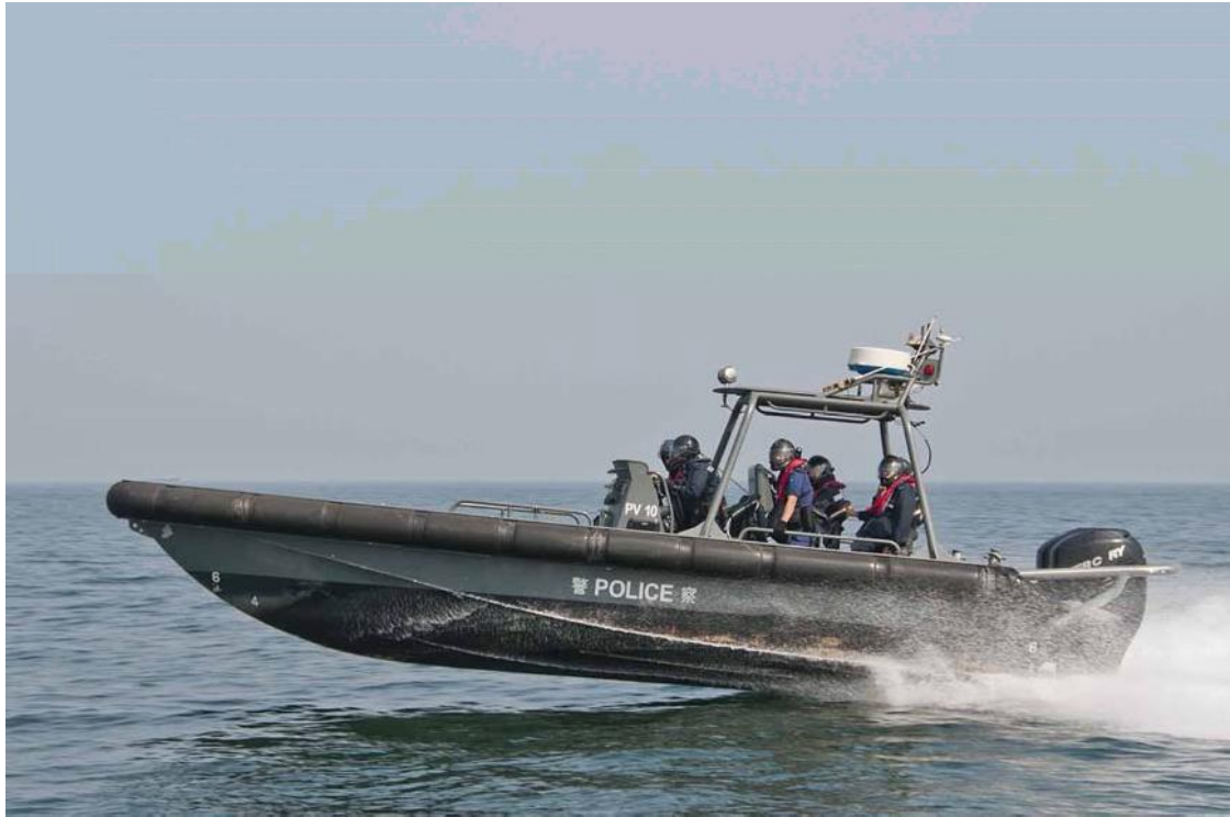
Police Vessel No. 10 Divisional Fast Patrol Craft (In service since 2008)