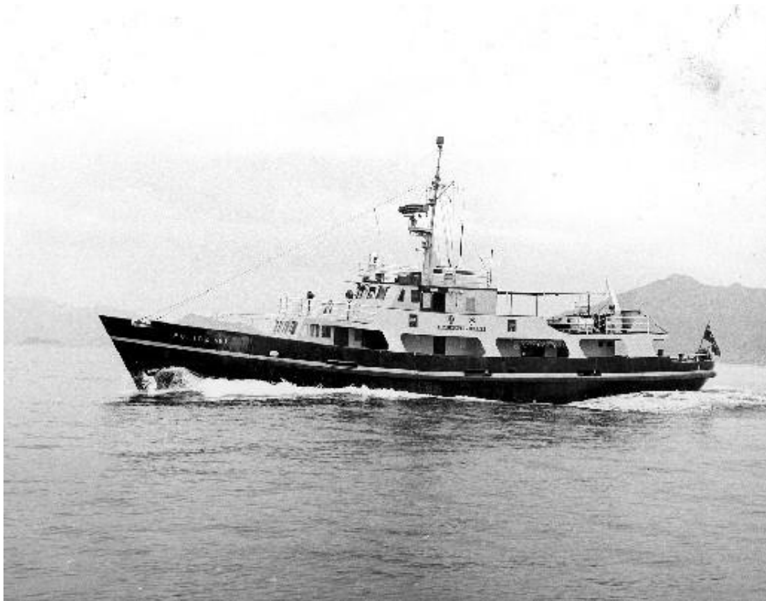
Police Launch No. 1 Sea Lion Command Launch (1965 – 1993)