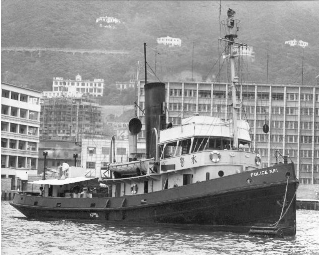
Police Launch No. 1 Empire Sam Command Launch (1946 – 1965)