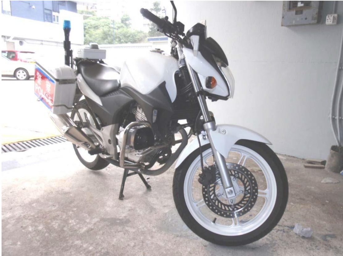
Motorcycle Small – Honda CB300R Used for patrol and traffic enforcement duties (In service since June 2011)