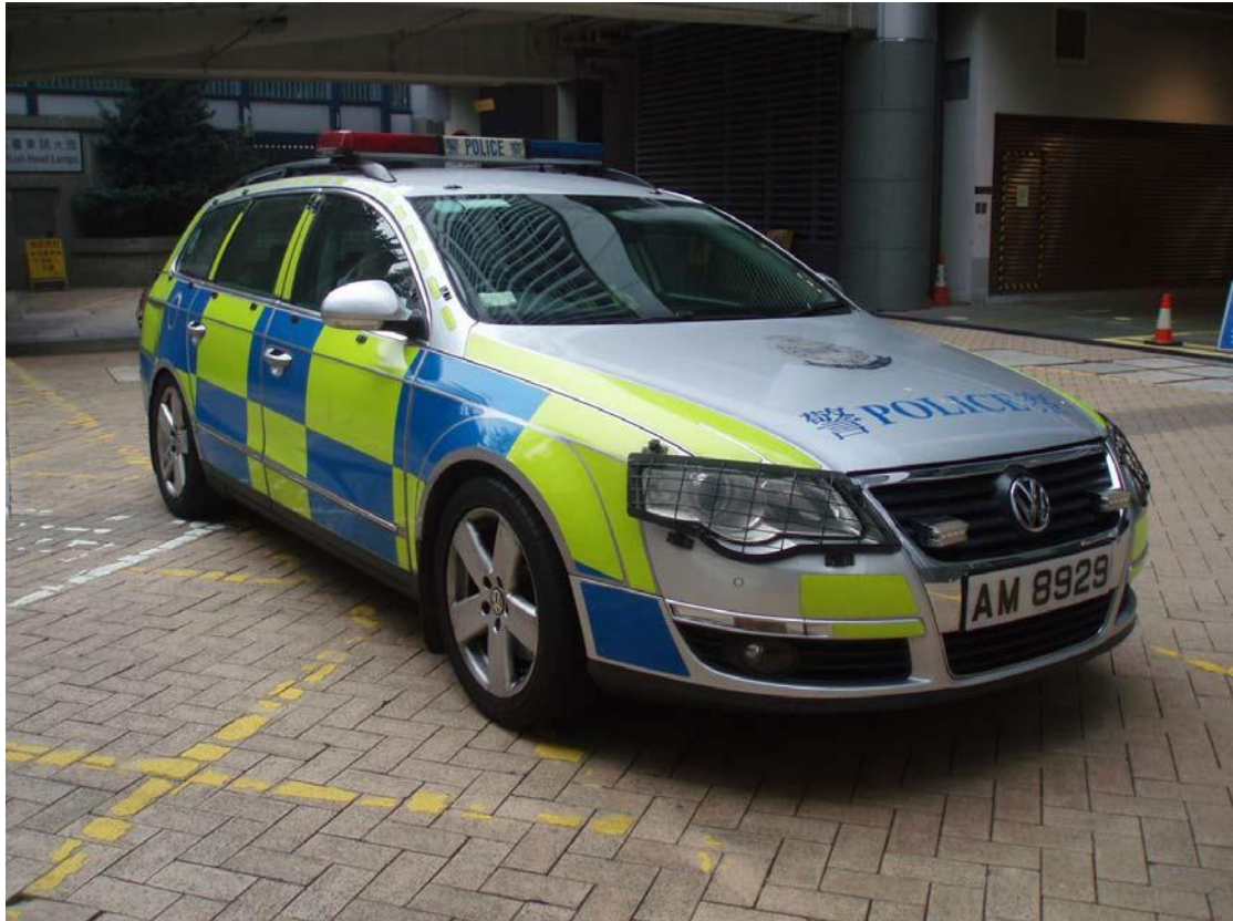
Estate Large – Volkswagen Passat Variant Used for patrol and traffic enforcement duties (2007 – 2015)