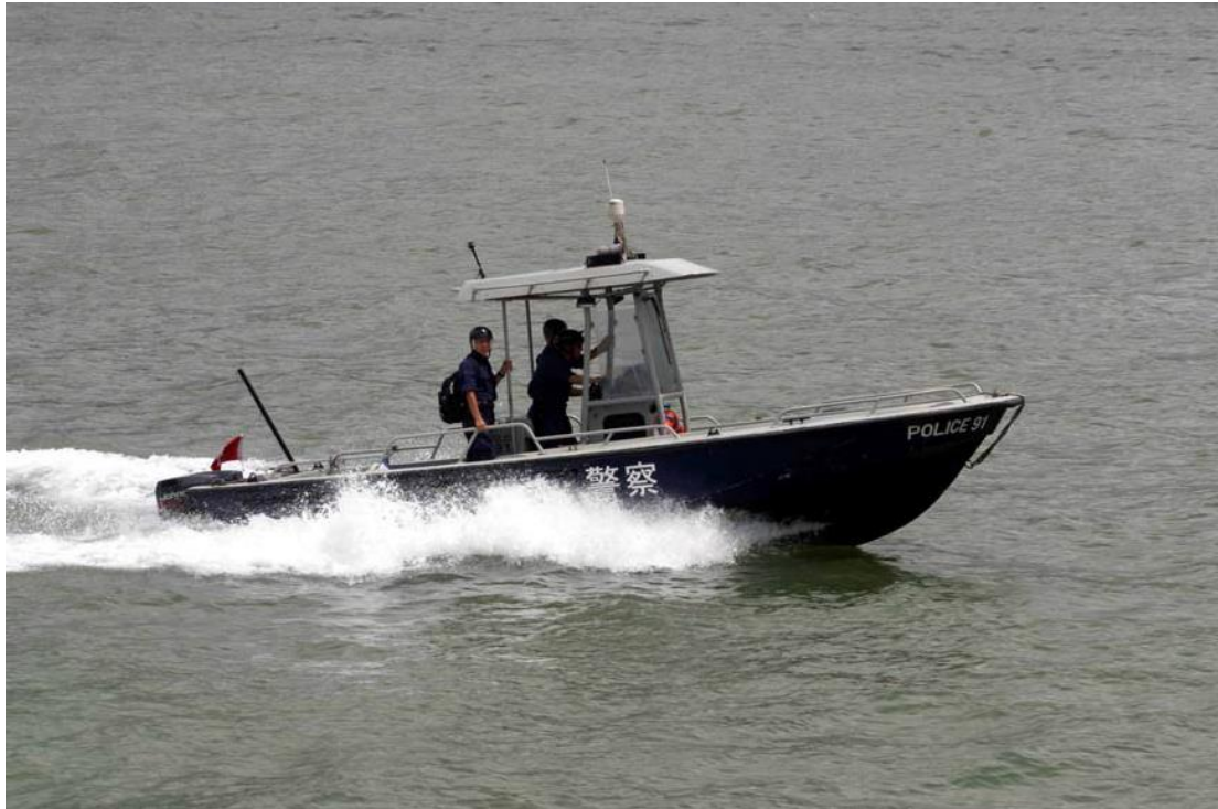
Police Launch No. 91 Boston Wharler 25' Inshore Patrol Launch (In service since 1997)