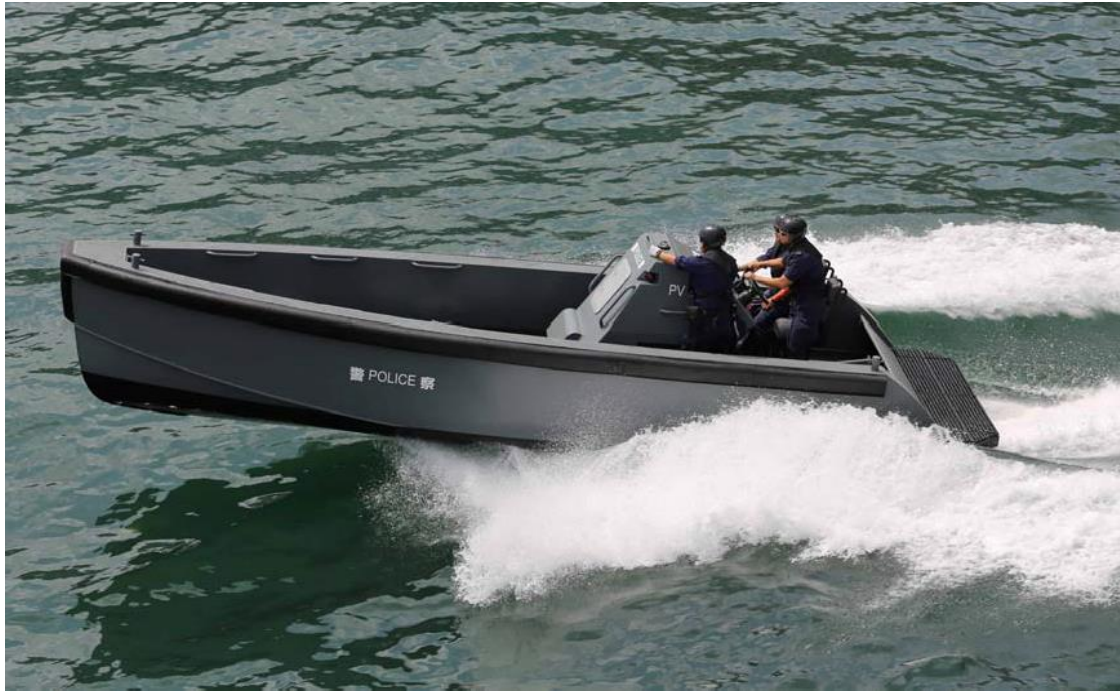
Police Launch No. 70 Shallow Water Craft (In service since 2015)