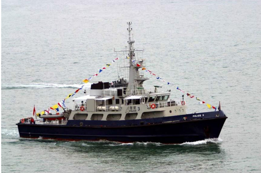
Police Launch No. 3 Sea Panther Training Launch (In service since 1987)