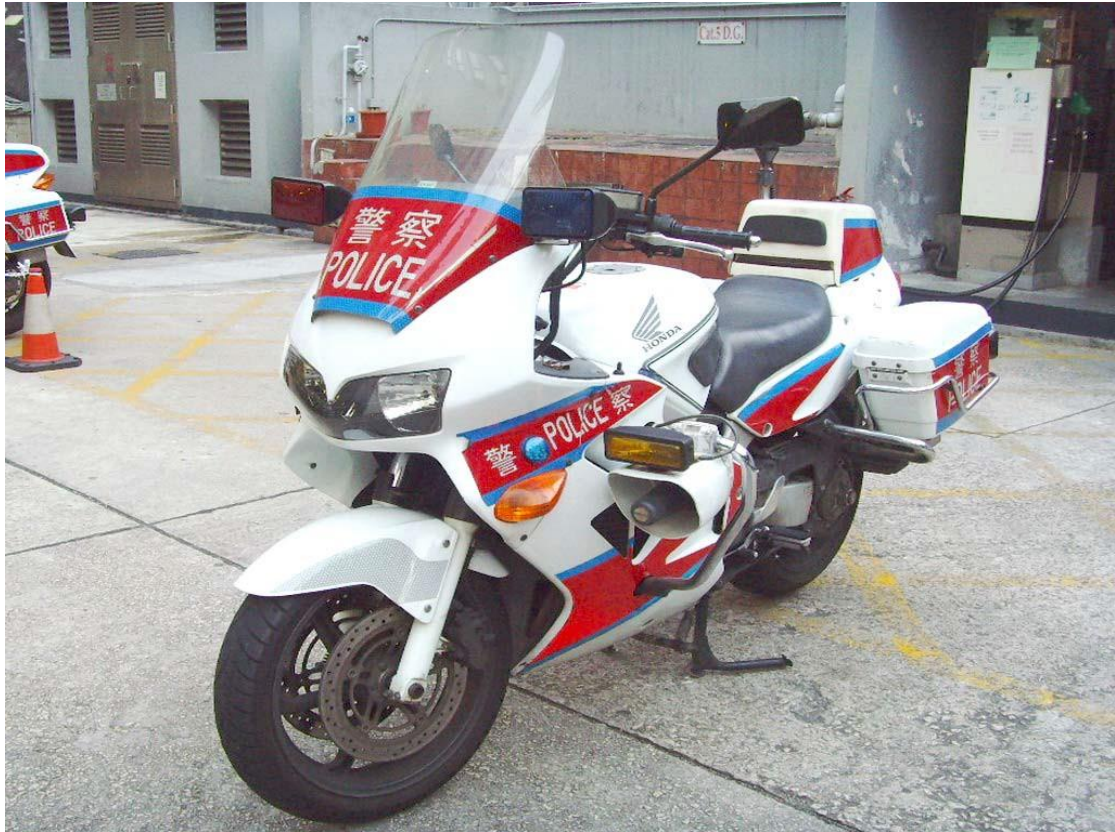
Motorcycle Large – Honda VFR800P Used for patrol and traffic enforcement duties (In service since Dec 2004)