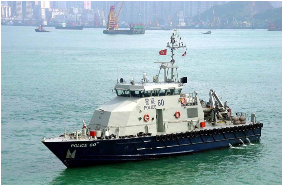
Police Launch No. 60 Keka Mark I Divisional Patrol Launch (In service since 2002)