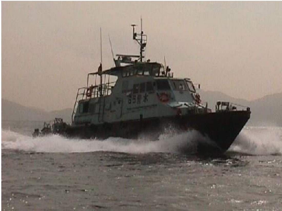
Police Launch No. 65 Dorado Damen Mark I Divisional Patrol Launch (1980 – 2004)