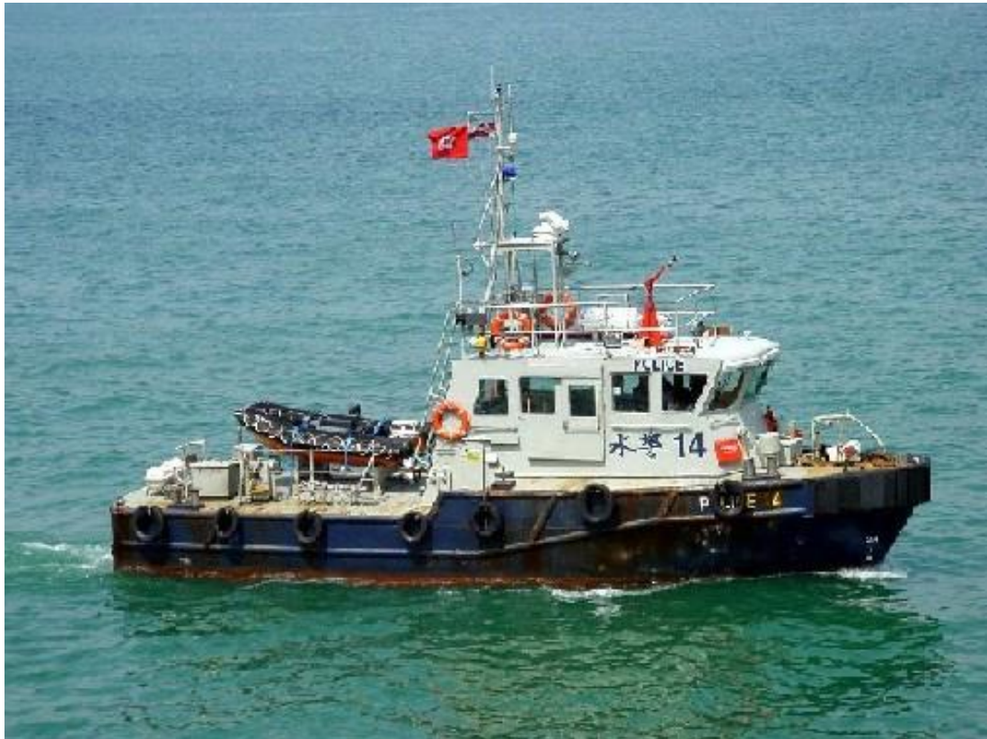
Police Launch No. 14 Tern Harbour Patrol Launch (1987 – 2010)