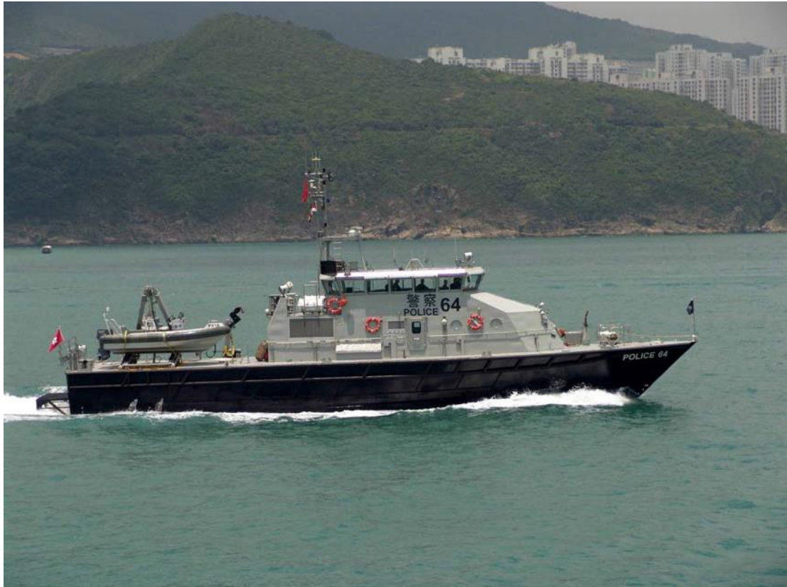
PL 64 Keka Mark II Divisional Patrol Launch (In service since 2005)