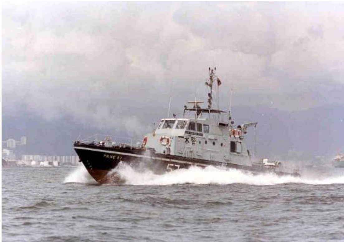
Police Launch No. 57 Mercury Damen Mark II Logistic/Emergency Launch (1982 – 1999)