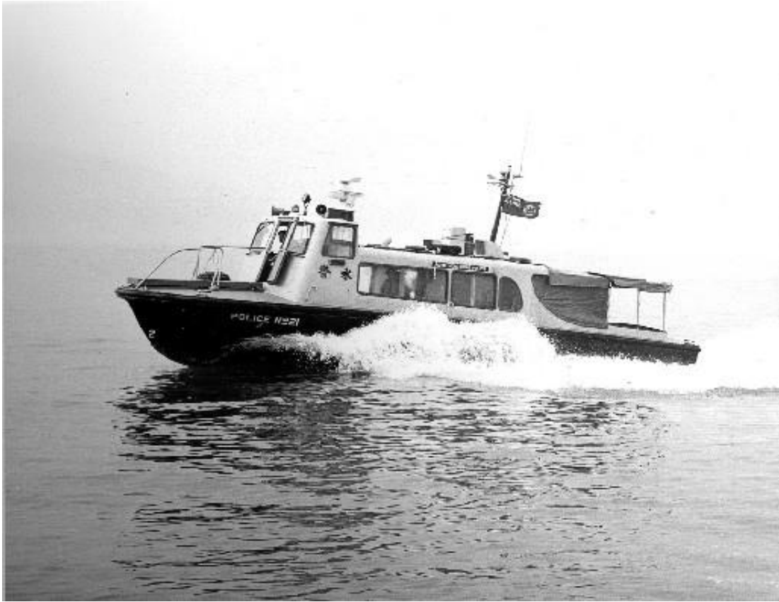
Police Launch No. 21 Swiftstream Deep Bay Water Jet Boat (1971 – 1986)