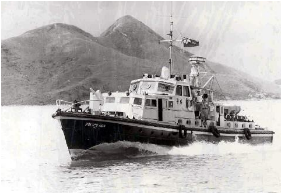
Police Launch No. 4 Sea Horse Command Launch (1958 – 1985)