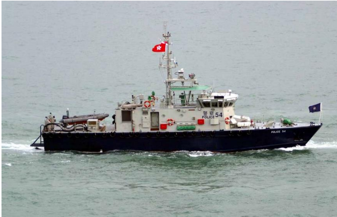
Police Launch No. 54 Protector Command Launch (In service since 1992)