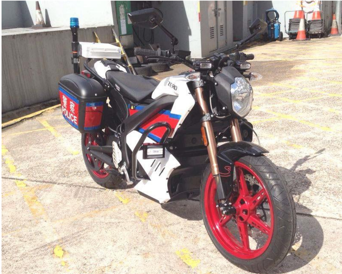
Motorcycle Small – Zero S ZF9 (Electric) Used for patrol and traffic enforcement duties (In service since August 2014)