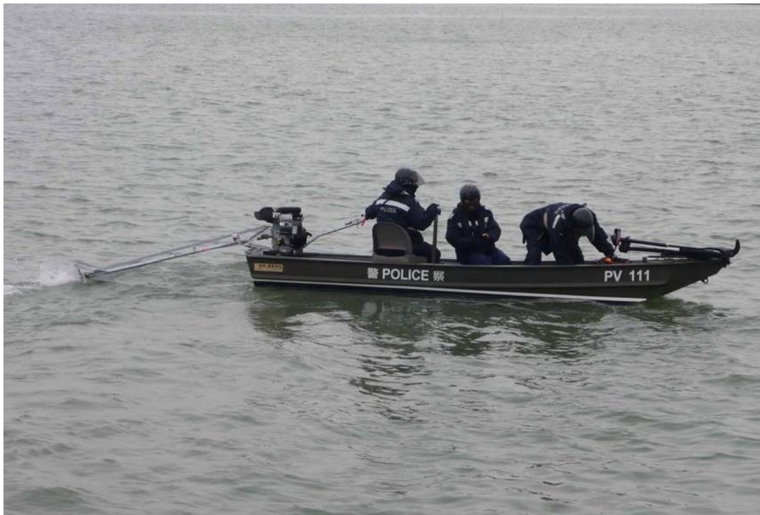
Police Vessel No. 111 Mudskipper (In service since 2010)