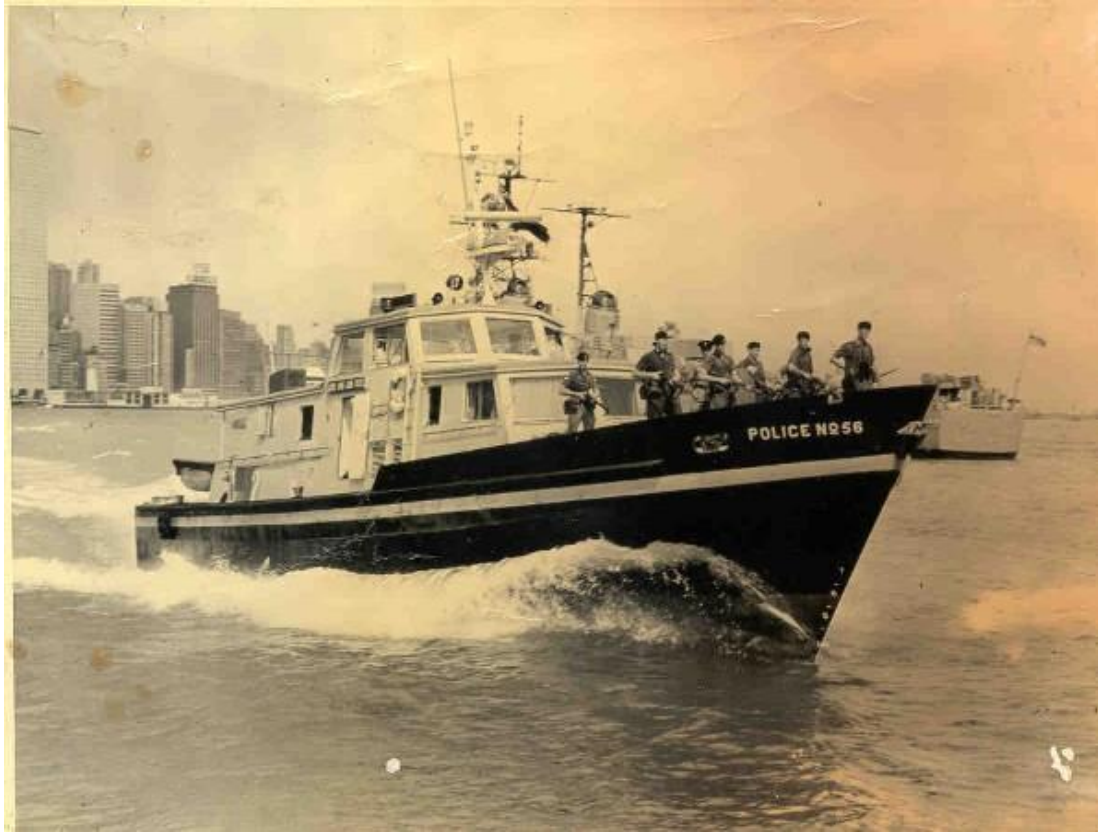
Police Launch No. 56 Sea Falcon Divisional Patrol Launch (1973 – 1992)