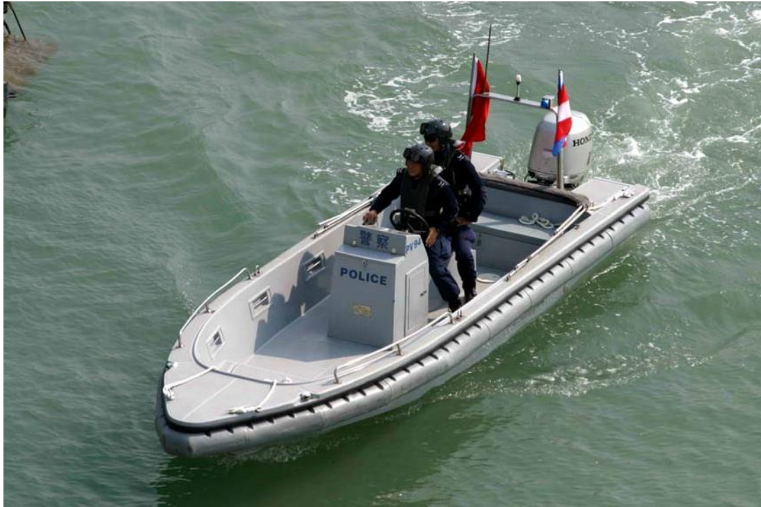
Police Vessel No. 94 Anda RH Shallow Water Patrol Craft (In service since 2003)