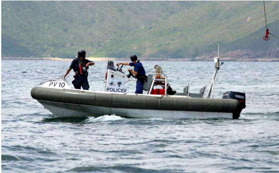
Police Vessel No. 10 Pursuit 640RH Police Launch Tender (In service since 2002)