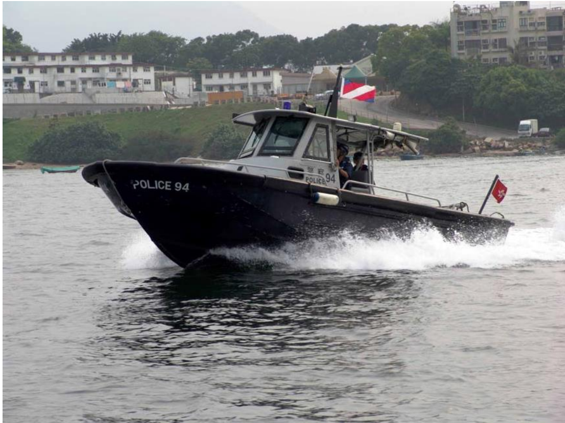
Police Launch No. 94 Boston Wharler 27' Inshore Patrol Launch (In service since 1997)