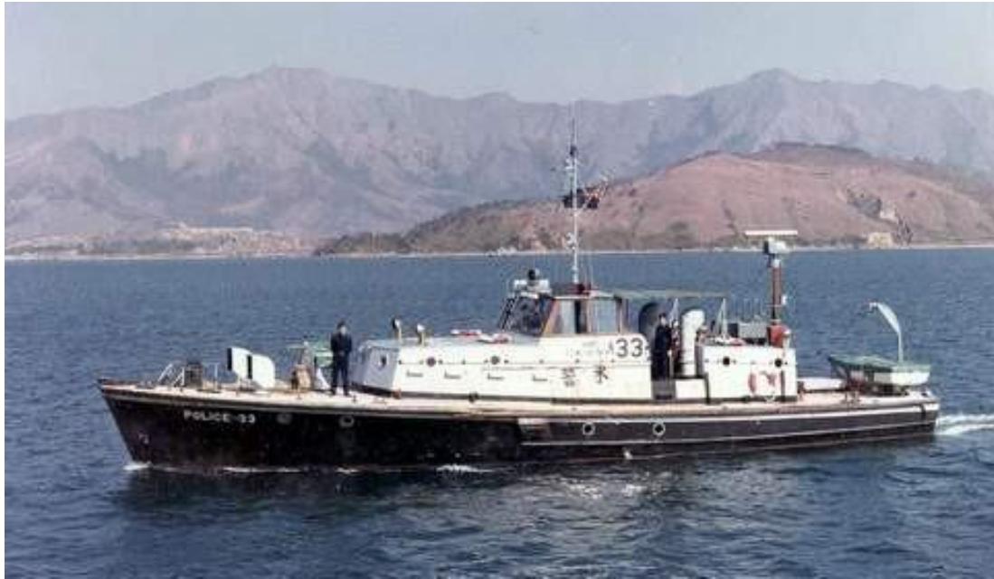
Police Launch No. 33 Sea Rescuer Divisional Patrol Launch (1962 – 1985)