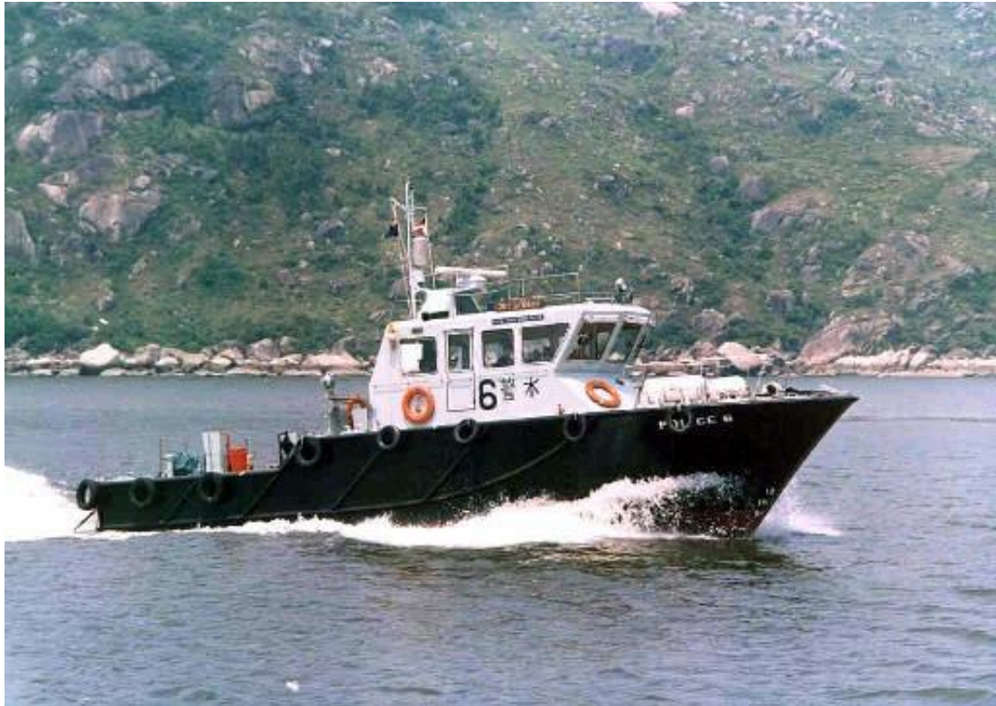
Police Launch No. 6 Jetstream Deep Bay Water Jet Boat (1986 – 2002)