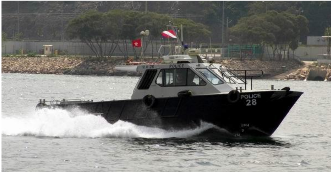
Police Launch No. 28 Seaspray Catamaran 9.9m Inshore Patrol Launch (In service since 1992)