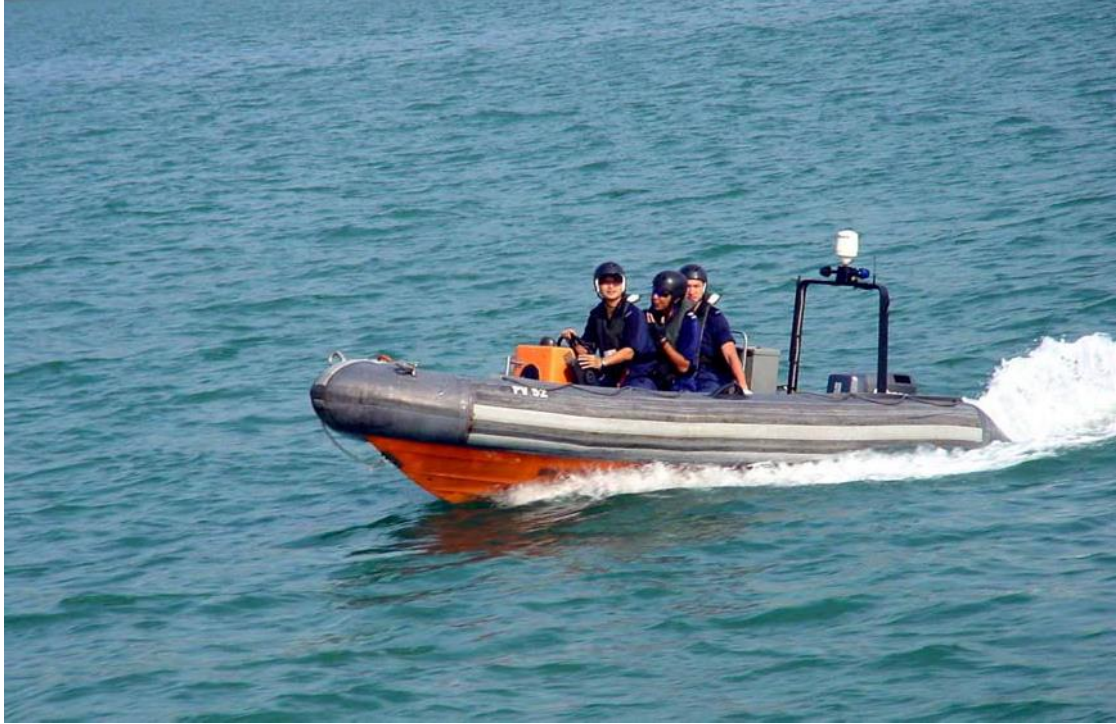
Police Vessel No. 52 Avon Searider Police Launch Tender (In service since 2002)