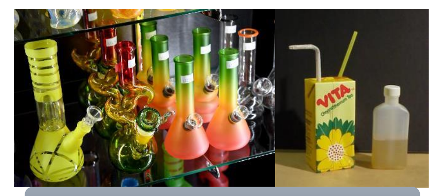
Bongs are often used for drug abuse