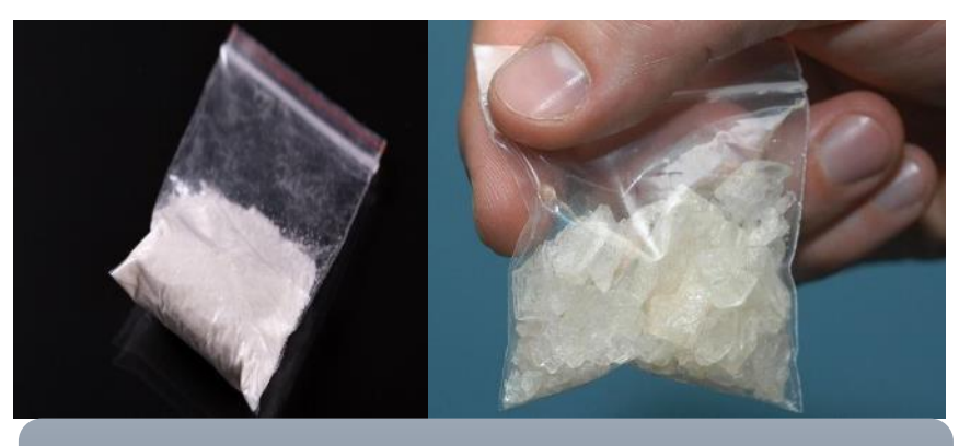
Powder-like/crystal-like substance contained in resealable bags