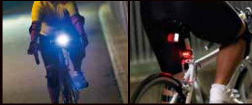
在黑夜或能見度低時，須亮起車前白燈及車後紅燈 Show a white light at the front of your bicycle and a red light at the rear when riding in the dark or at times of poor visibility