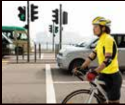
遵守交通規則，遵照交通標誌、道路標記和燈號的指示行車 Obey traffic rules, traffic signs, road markings and traffic light signals on the road