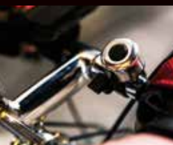
出發前檢查單車各部件，確保操作正常 Check all components of your bicycle are in good working order before setting off