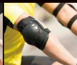
佩戴頭盔、護墊及其他保護裝備 Wear a helmet, pads and other protective gear